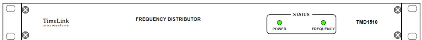
TMD1510 front panel

A dry contact output provides Power and frequency outputs status.